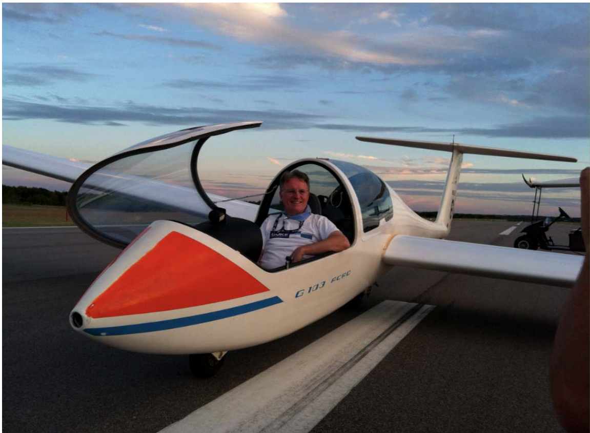
The Unavoidable Post-Solo Smile

Instead of waiting for the stars to align in the real world, my simulation-based training allowed me to start making real progress, and the capacity to practice daily helped me retain what I had learned. The whole process was very satisfying, very efficient, and VERY cost effective.