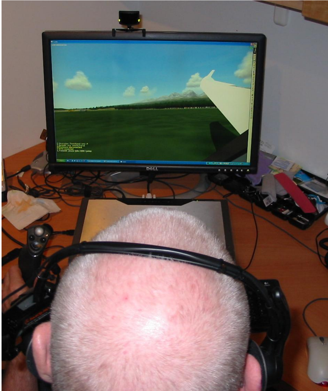
Figure 4: Looking out at right wingtip