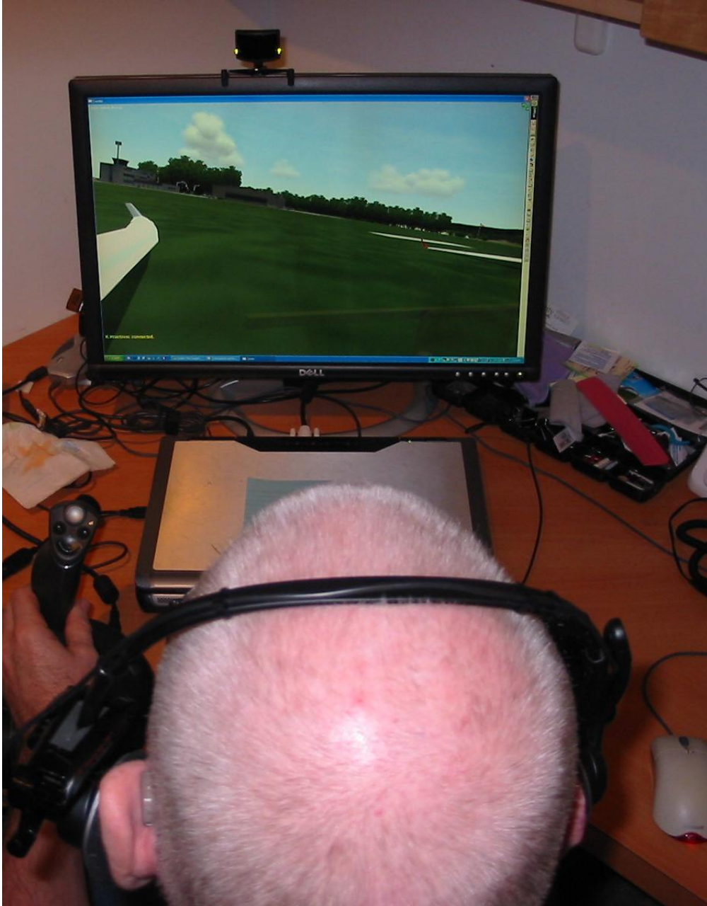
Figure 3: Looking at left wingtip. Note angle of pilot's headset