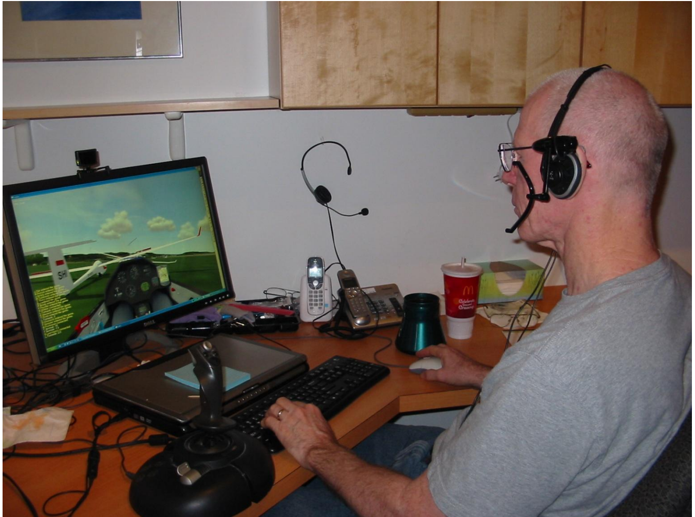
Figure 1: Clip-Pro IR LED shown mounted to left side of pilot's headset, with IR camera on top of display

The good news regarding this setup is that it does indeed live up to its promise of providing a more realistic and immersive simulation experience when flying Condor, and after some initial teething problems I have decided to move from 'Mouse Look' to the TrackIR arrangement as my view management system of choice. The bad news is that the TrackIR system is much more complicated than the dirt-simple Mouse Look method, requires a fair bit of patience and experimentation to get right, and has some side-effects that can detract significantly from the overall quality of the experience.