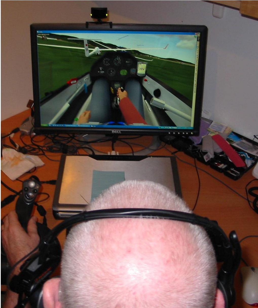
Figure 5: Looking down at Condor pilots lap